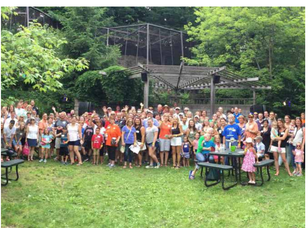
To celebrate its 125th anniversary, the Mary Free Bed Guild hosted a "Zoobilation" party at John Ball Zoo for employees to celebrate its 125th anniversary (top images), as well as the Beach Boys-themed Grand Rapids Symphony Picnic Pops concert.