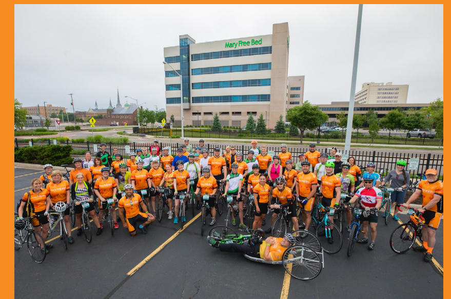
Team Mary for the 2018 Gran Fondo

SCAN THE QR CODE to learn more about Gran Fondo and how you can participate in the race for rehabilitation.