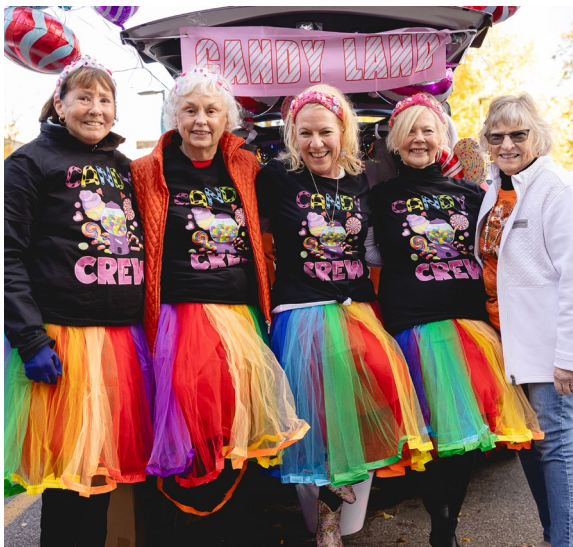
Guild members volunteer at the Pediatric Trunk-or-Treat event

The Guild’s generosity not only uplifts the Mary Free Bed teams, but extends far beyond our walls into the community. Through sponsorship and support they ensure sustainability for programs that help Mary Free Bed patients long after they graduate.